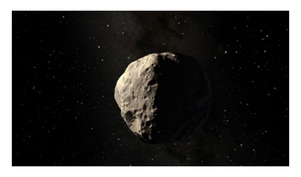
This is a Big One