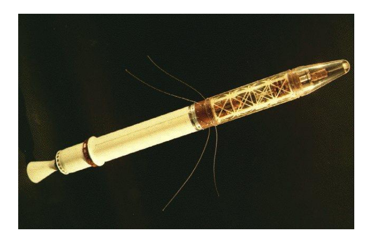
Explorer 1 Launch Vehicle

This was a Big Scientific Discovery since we were clueless that they existed.